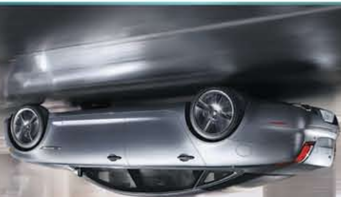
©2011 JAGUAR LAND ROVER NORTH AMERICA, LLC

OFFICIAL VEHICLE OF BRITWEEK™ SPONSORED BY JAGUAR DEALERS YOUR SOUTHERN CALIFORNIA